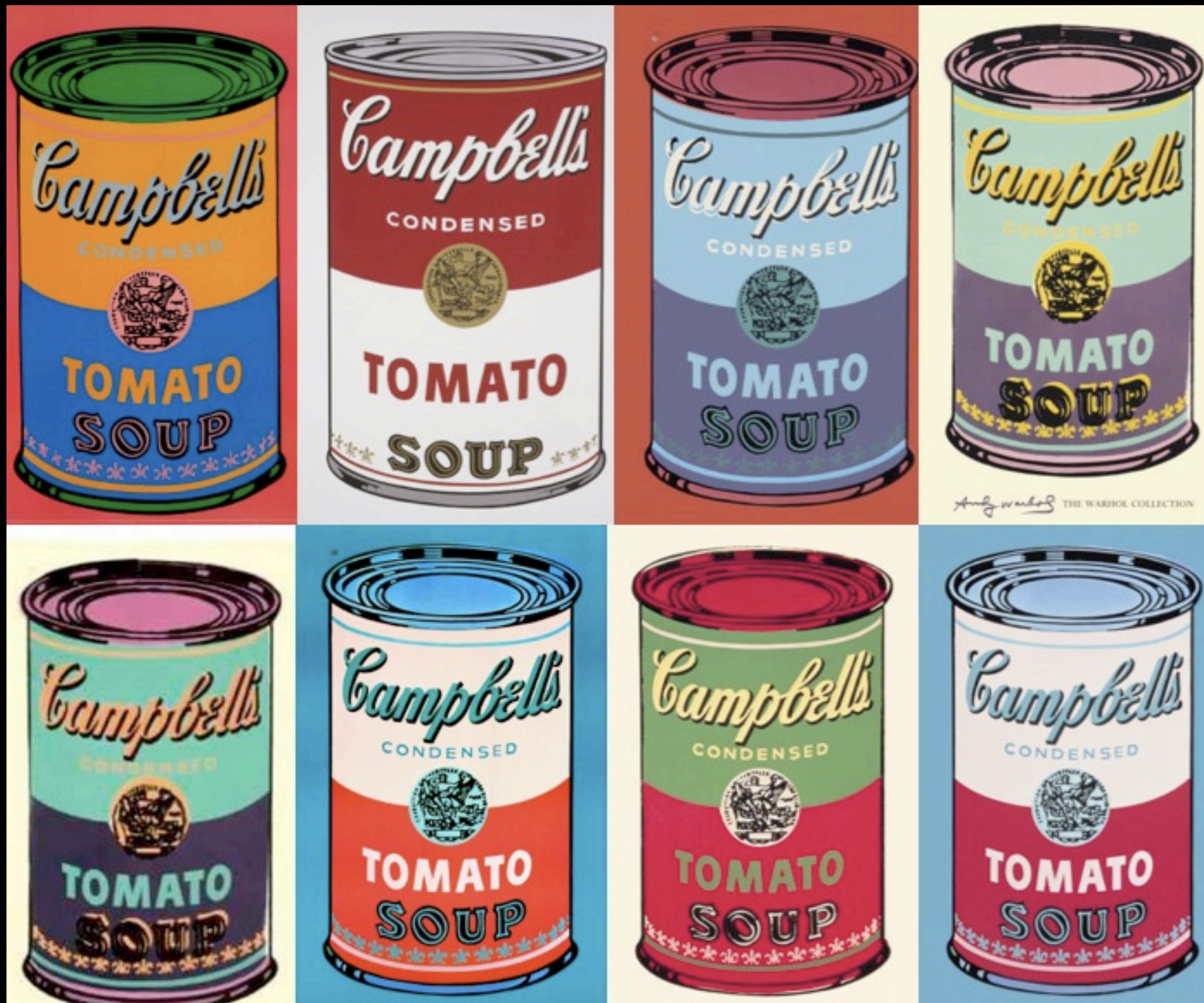
Andy Warhol, Campbell's Soup Cans, 1968